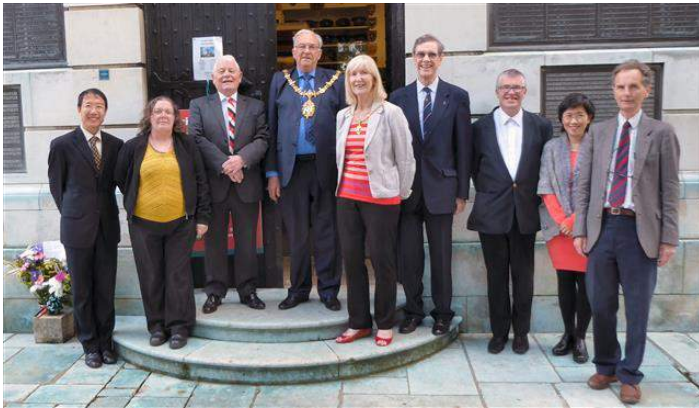
Some of the volunteers with the Mayor and Mayoress